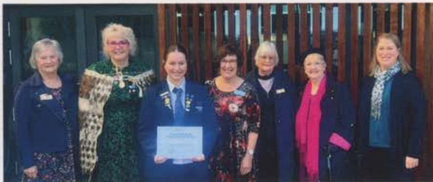
Zonta D16 Kakahu 2022 -2024