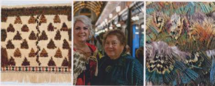
Zonta D16 Kakahu 2022 -2024

I hope you have enjoyed hearing about it. When I wore it for the first time at the Governors Changeover Dinner, I was quite overwhelmed, it is extremely special, and now knowing all of this information, I felt you would all like to hear this too, so it is not just special to myself, but to have me wear it with pride for our whole District to enjoy.