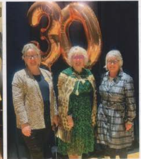
Zonta D16 Kakahu 2022 -2024