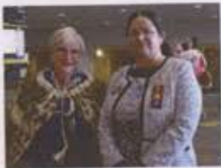
Governor Souella Cumming with Lieutenant Governor Desirae Kirby at the District 16 Conference.