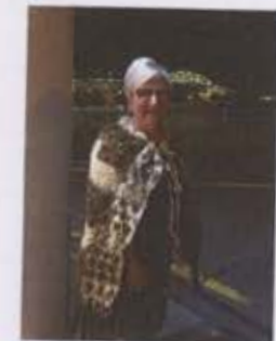
Governor Souella Cumming with the Auckland Harbour Bridge lit in orange to acknowledge the 100 centenary celebration and the start of the 2019 Zonta Days No Campaign.